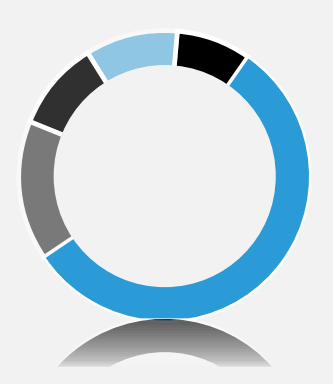
Shareholder structure Pankl Racing Systems AG (Dec. 31, 2015)